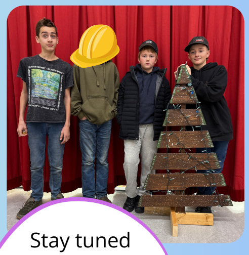
for Gaga Ball Pit updates and photos!